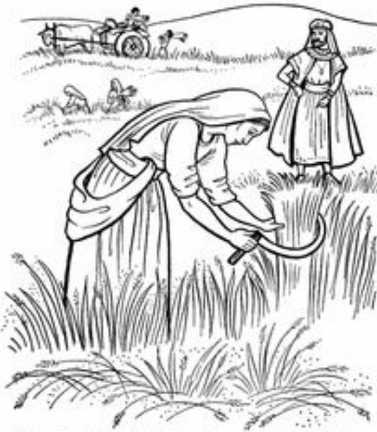
Ruth gleaned in the fields and won the heart of Boaz. Her son was the grandfather of King David.

Back in Israel, these two women were very poor and struggled to feed themselves. Ruth got some food by harvesting at the edges of fields after the farmers had cleared the main ground. One of the